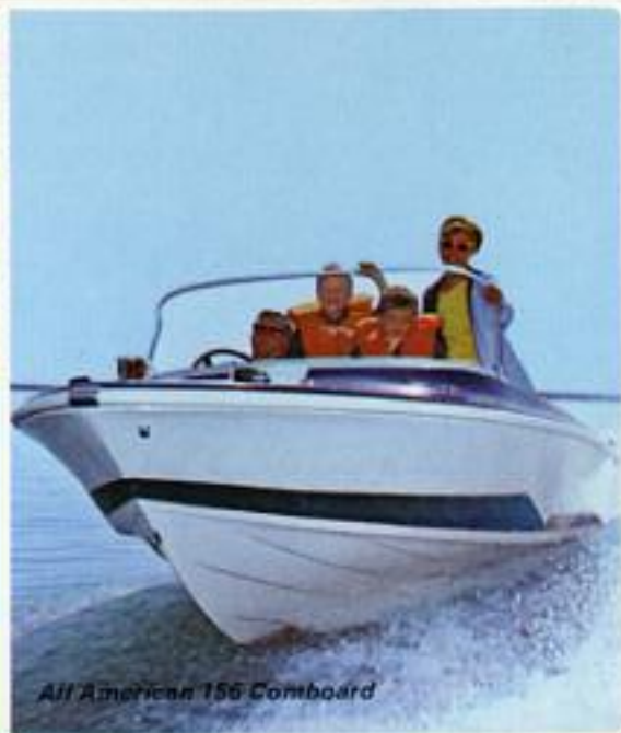
All American 156 Comboard

More people zip out to the lakes in new Larsons