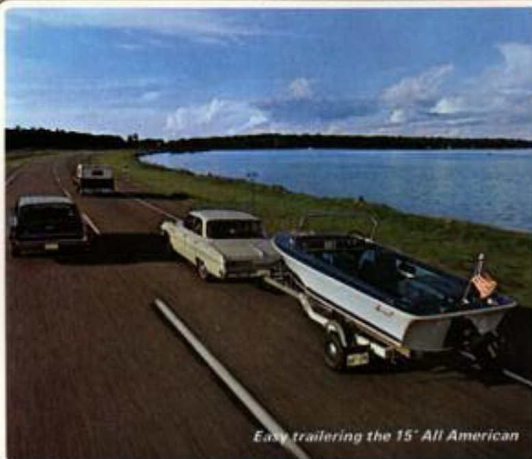
Easy trailering the 15' All American