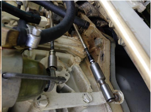
Forward (Fast Idle) but Hitting Stops, Still Neutral – Should be able to throttle up a bit here but hitting stops first.