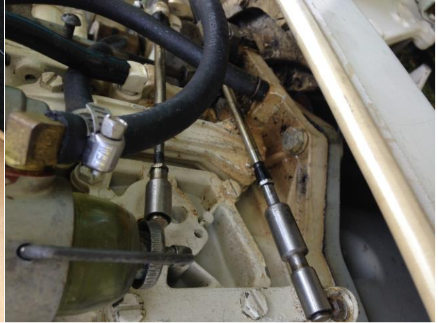
Control Box Neutral